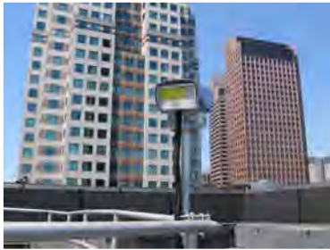
The Wireless WAN Pros!

AEI FASTLINKS was contracted by Sullivan & McLaughlin, a large construction firm out of Boston, MA to establish a 1000Base-Fx (1.25Gbps) connection between two of its client's facilities in downtown Boston. Their client, had outgrown its current office space and had acquired additional space in a nearby building. AEI was brought into spec. out a secure, high capacity, system that could provide reliable communications while shooting through glass at one side. A GigE FSO link was recommended and in turn installed.