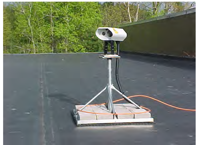
The Wireless WAN Pros!